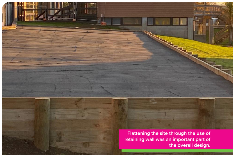
Flattening the site through the use of retaining wall was an important part of the overall design.

“Movements on the site had to happen before 8:00am and after 4:00pm or on the weekends. There was never an issue with noise or safety and the workers were respectful and always dressed appropriately. And they were incredibly fast. I was genuinely floored how much they had achieved in one day.”