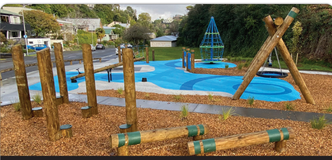
The new playground included Timber Balance Beams and log steppers for added physical activity and exploration opportunities.